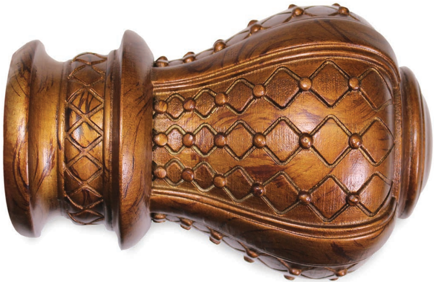
WESTMINSTER Tortoise shown. Size 2". Available in all colors.