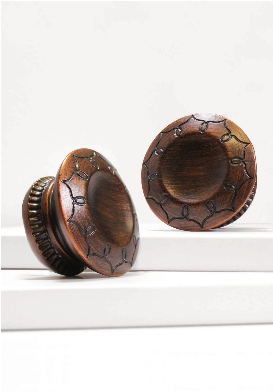
HASTINGS Burnished Copper shown. Size 2". Available in all colors.