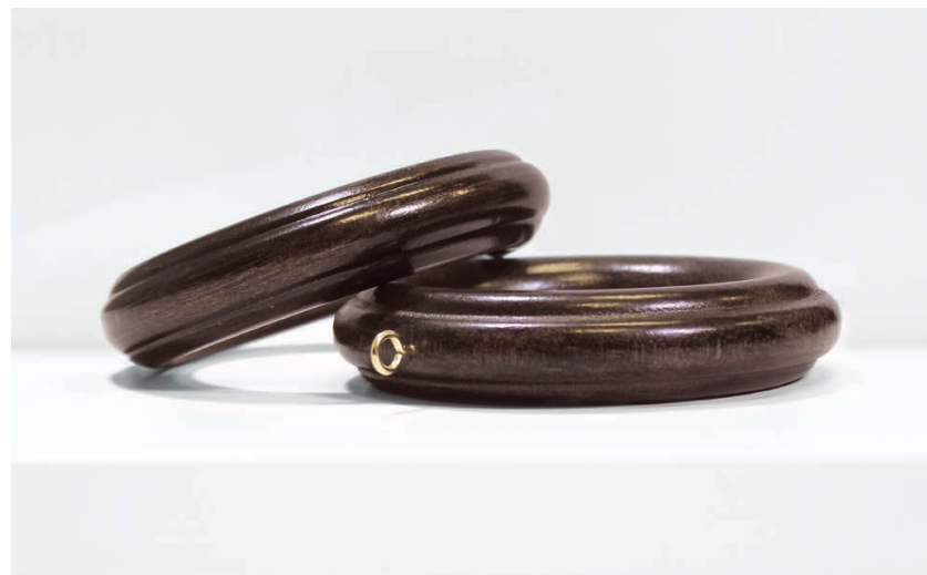
DECORATIVE RING Tortoise shown. Size 2". Available in all colors.