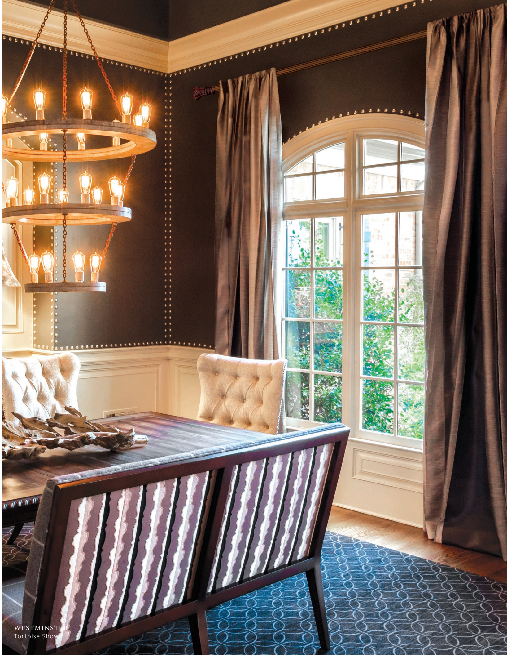
WESTMINSTER Tortoise Show