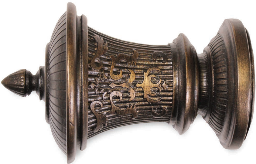
RENAISSANCE Bronze shown. Size 2". Available in all colors.