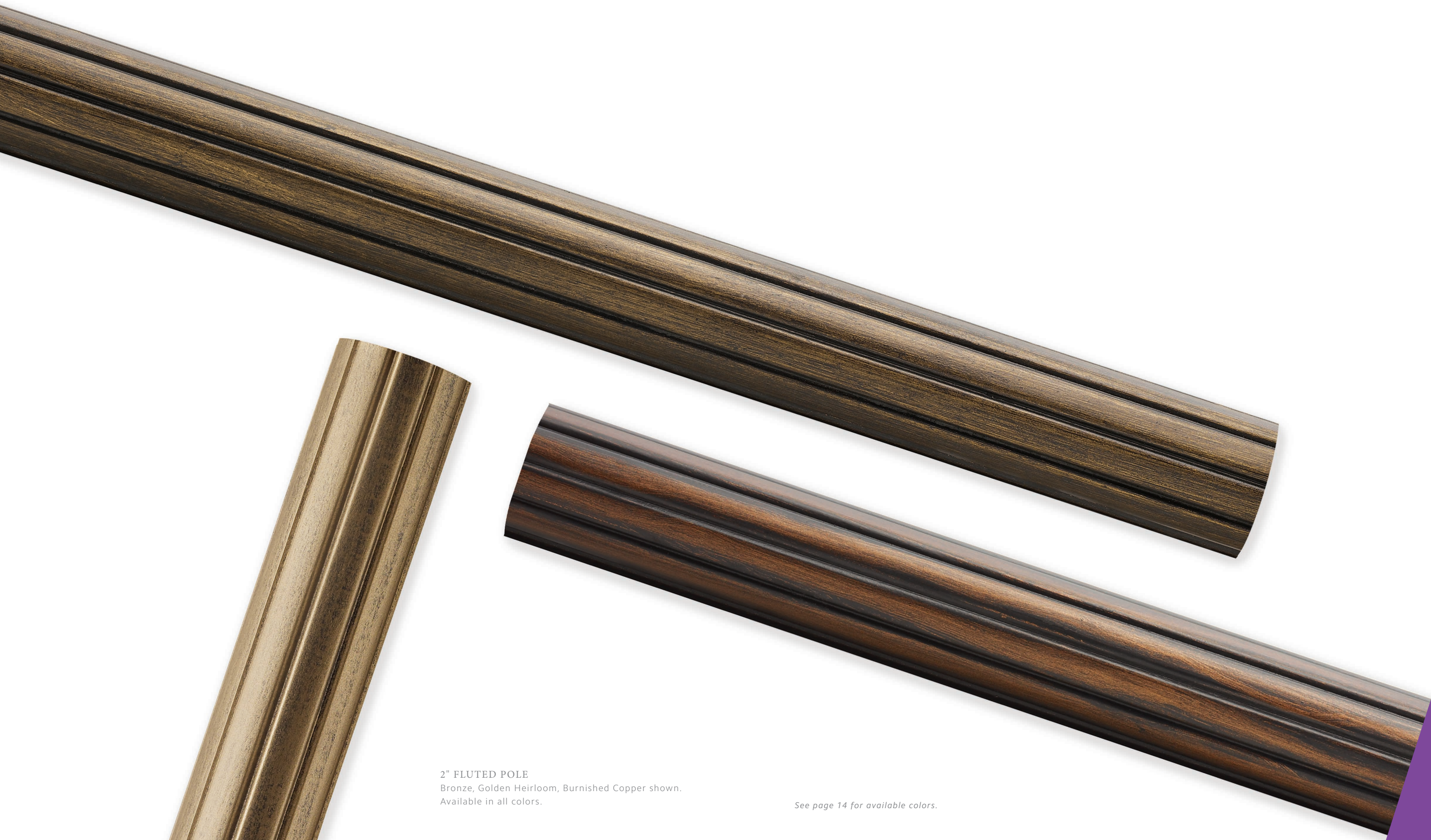
2" FLUTED POLE Bronze, Golden Heirloom, Burnished Copper shown. Available in all colors.