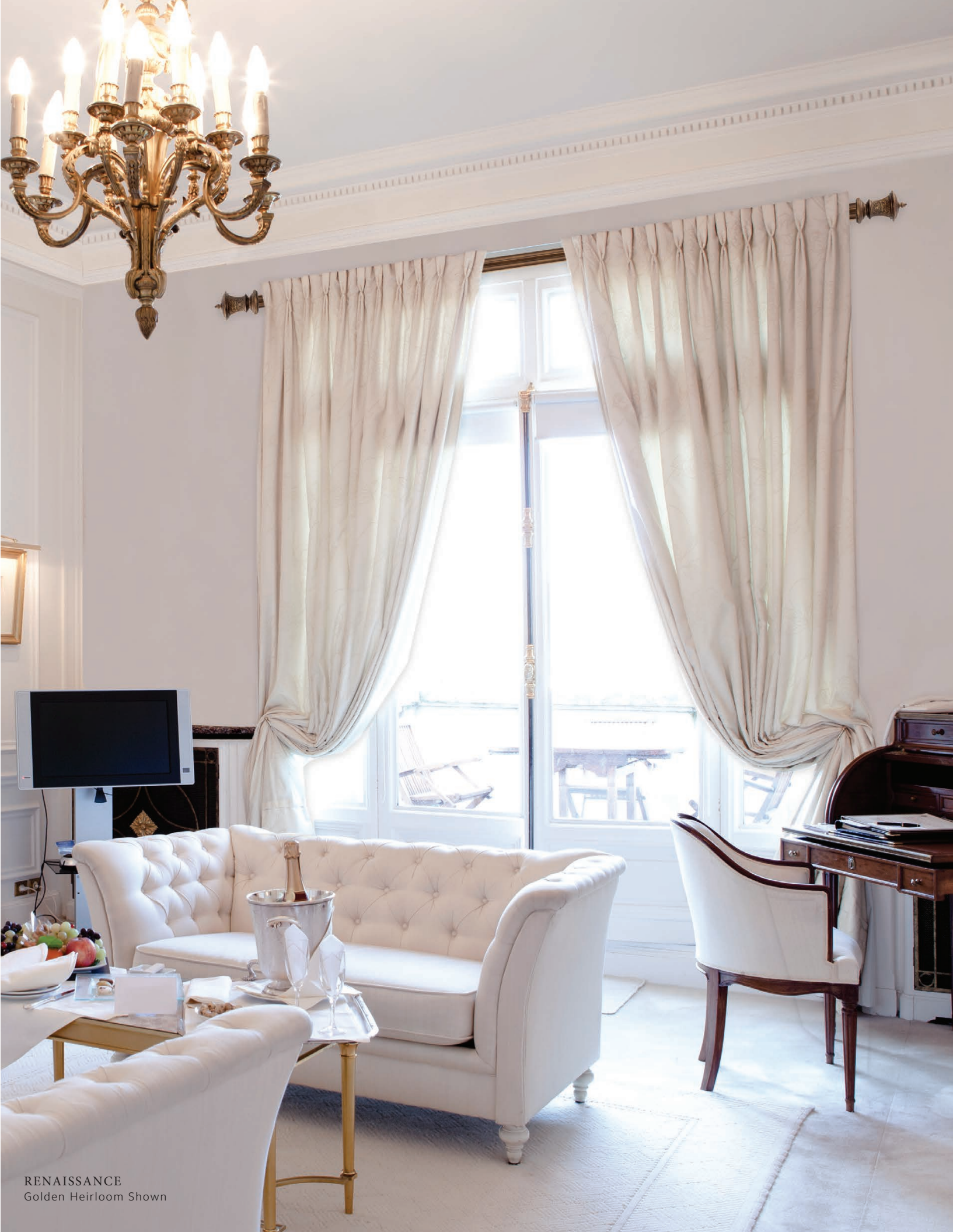
RENAISSANCE Golden Heirloom Shown