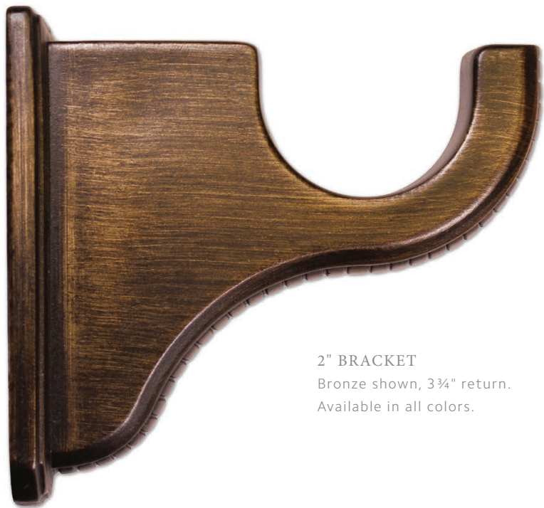
2" BRACKET Bronze shown, 3 3/4" return. Available in all colors.