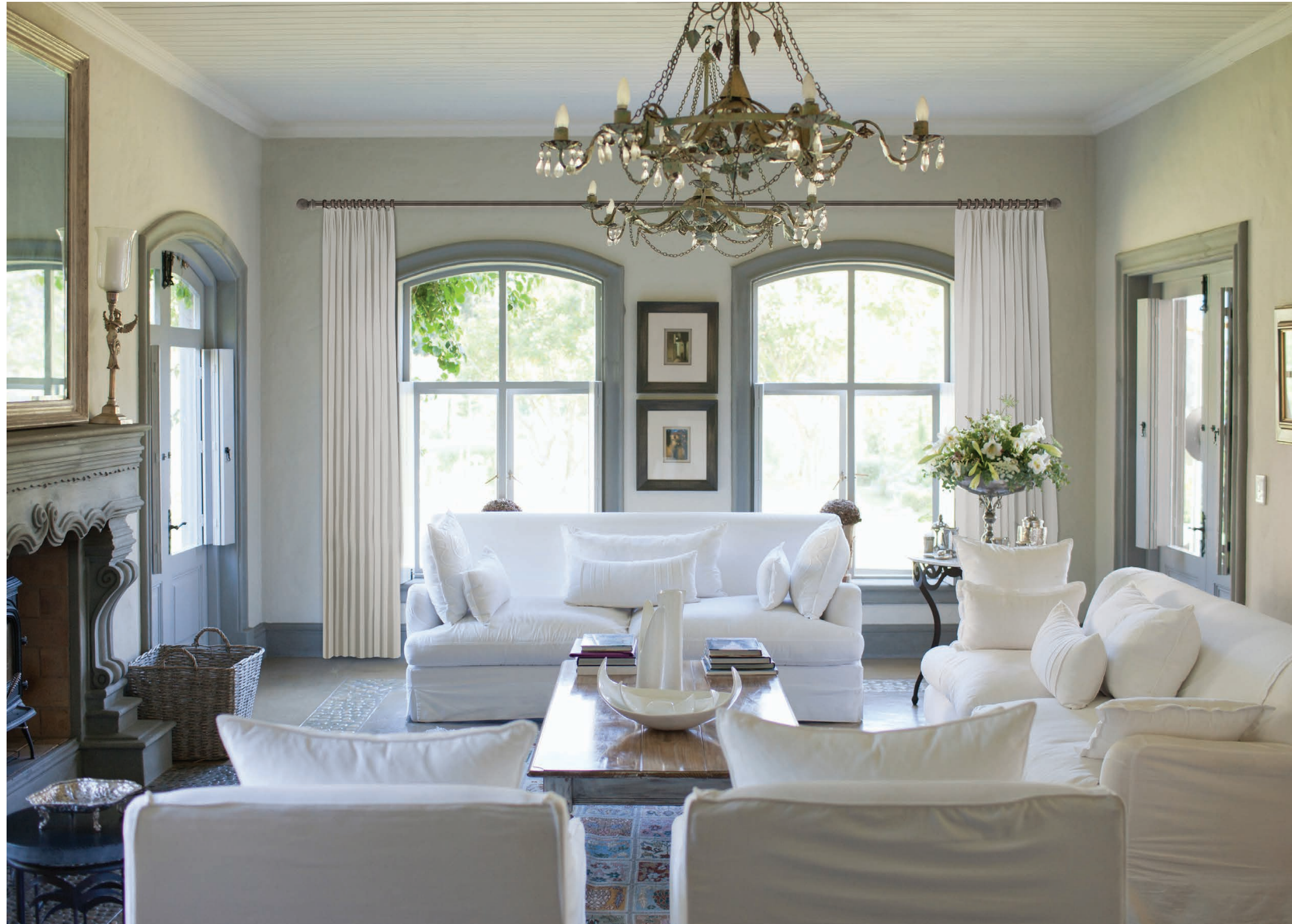
VICTORIAN Golden Heirloom Shown