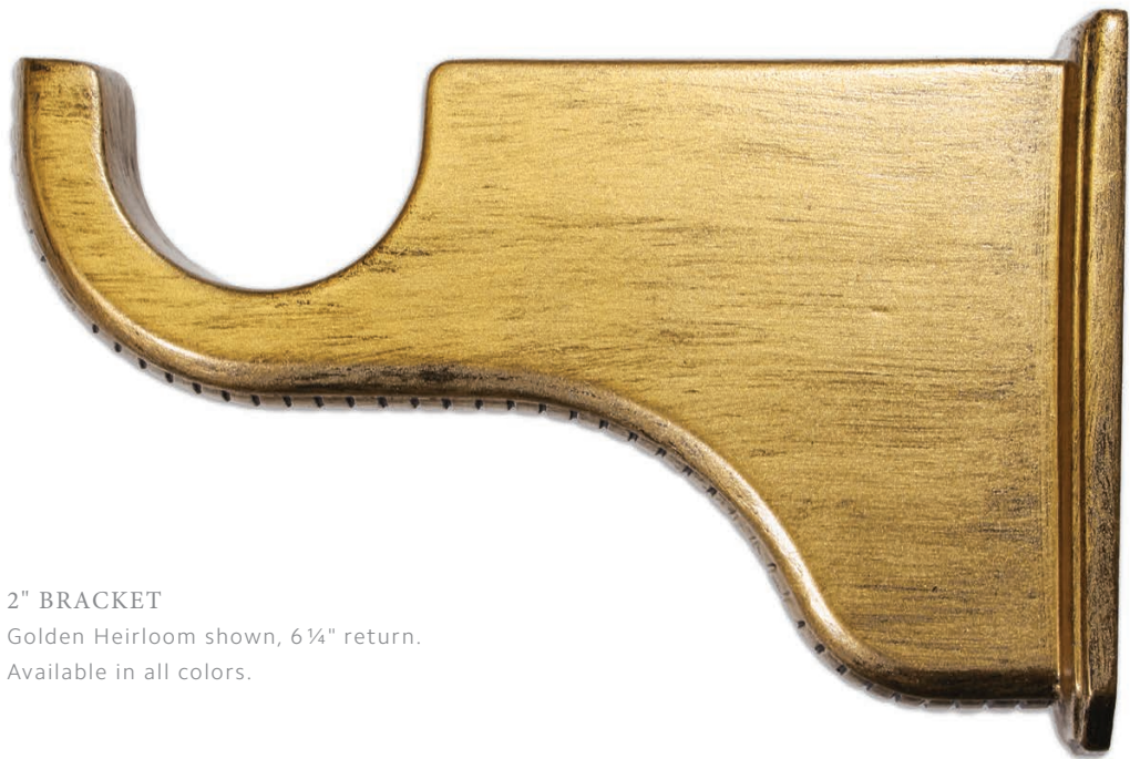
2" BRACKET Golden Heirloom shown, 6 1/4" return. Available in all colors.