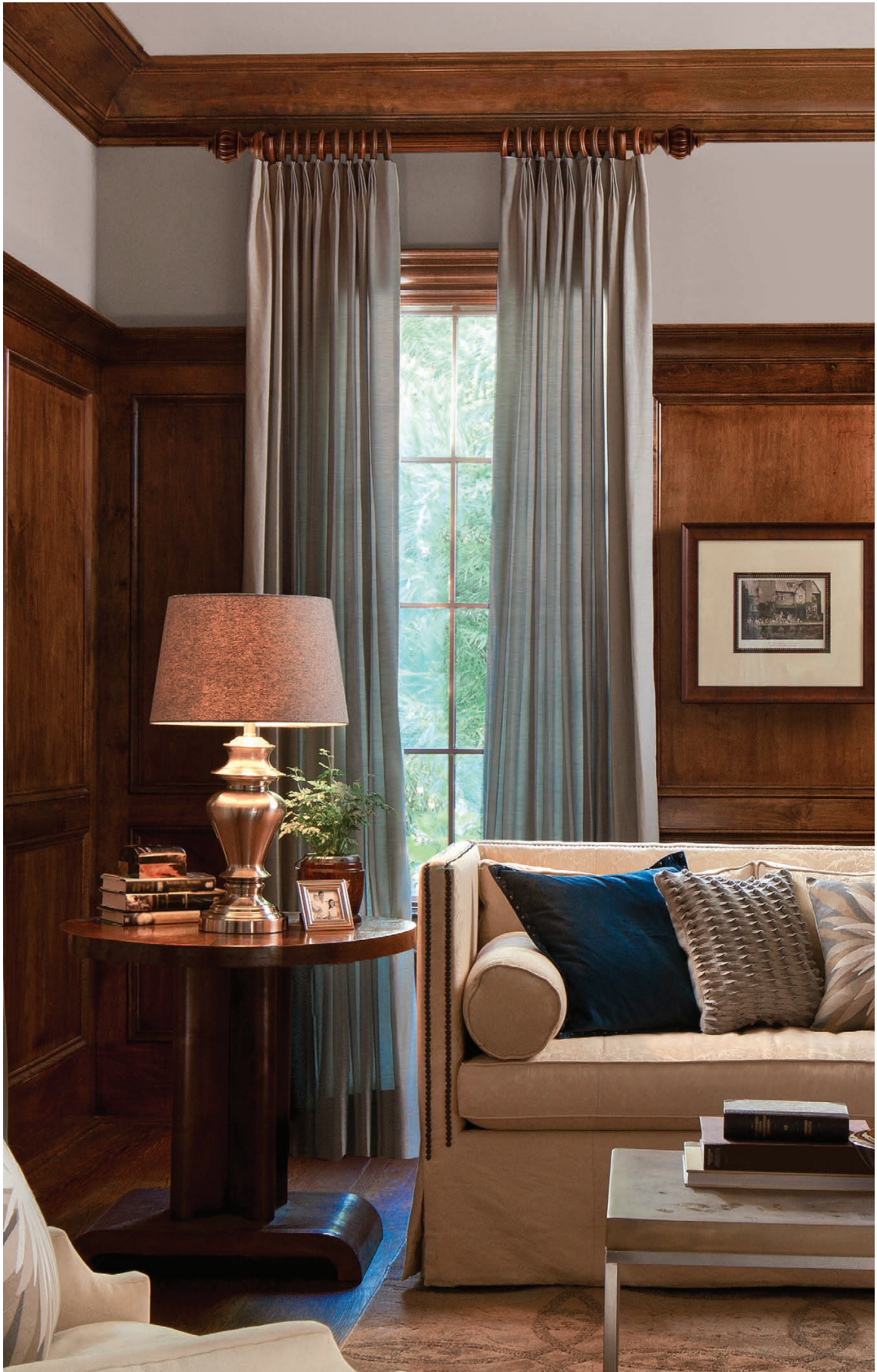
ARMADA Tortoise Shown